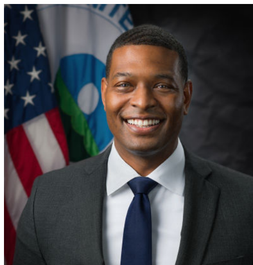
Administrator Michael S. Regan